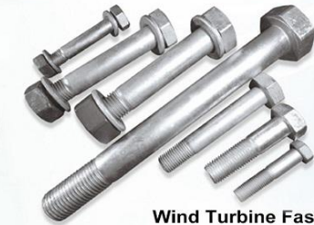
Wind Turbine Fasteners

Advantage of tg co., ltd. Hot-Dip Galvanizing (HDG) Products: